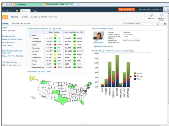
Team Dashboard in SharePoint 2010